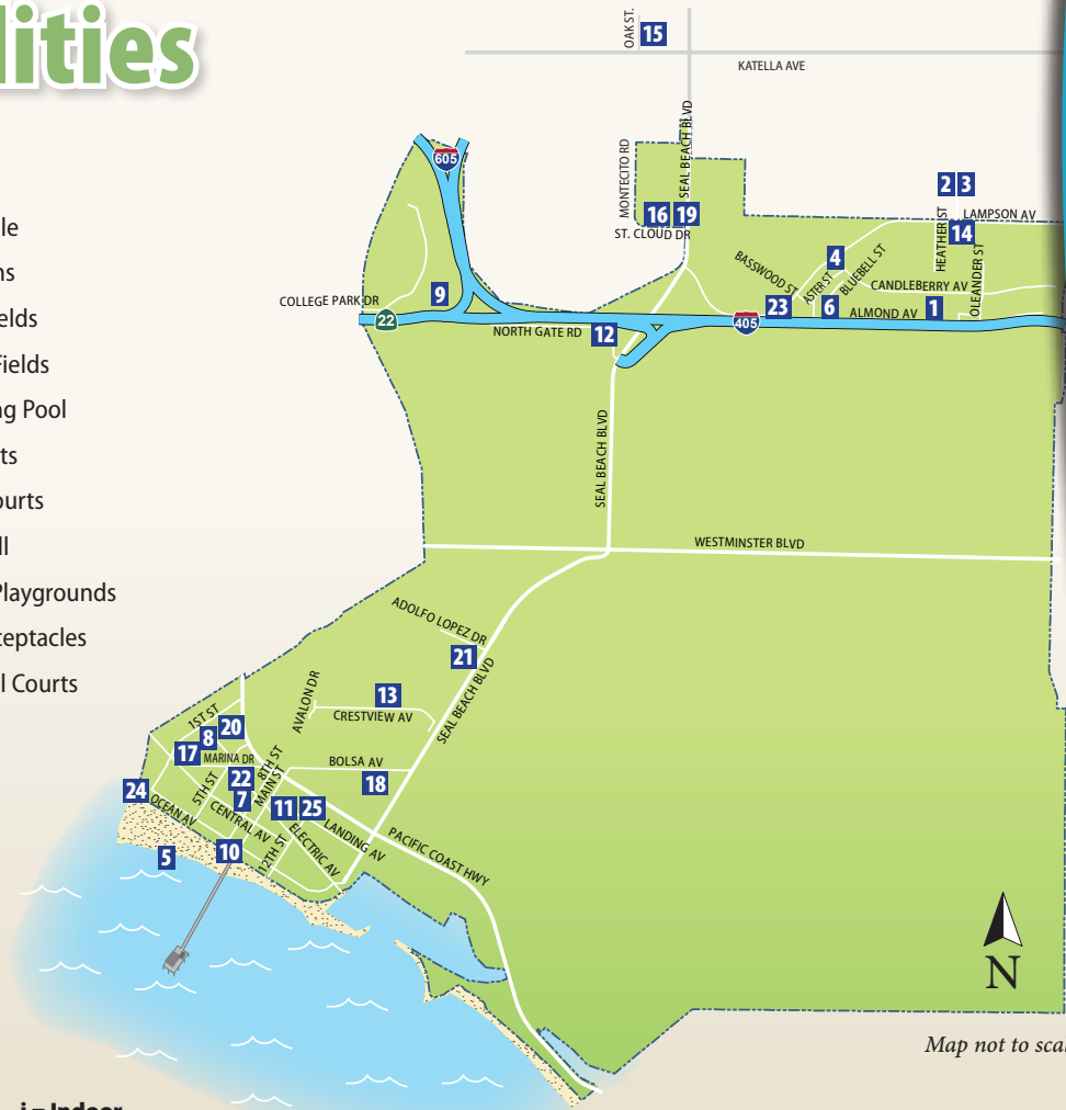
Map not to scale.